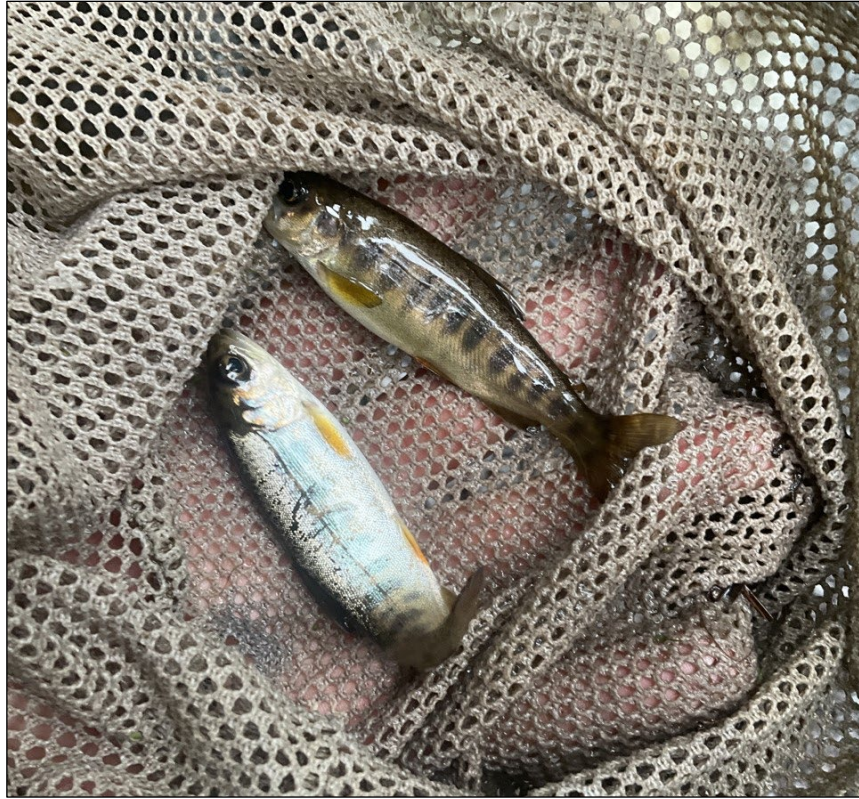
Figure 1.—Juvenile coho salmon captured at waypoint 1534.