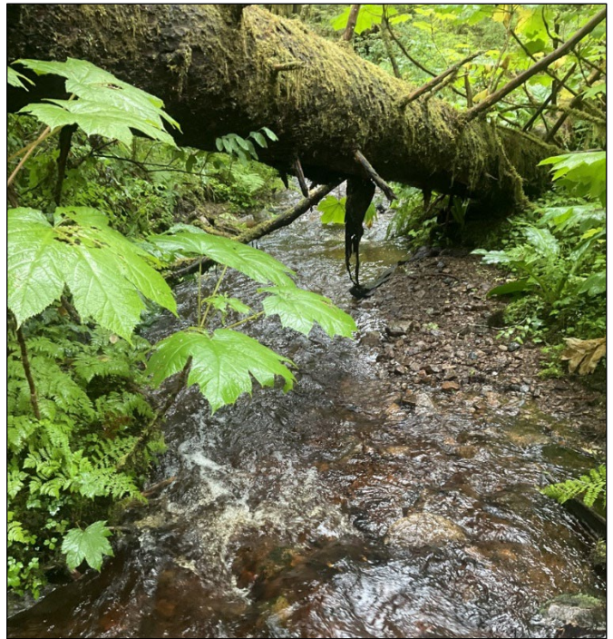
Figure 3.—Channel upstream of waypoint 1312.