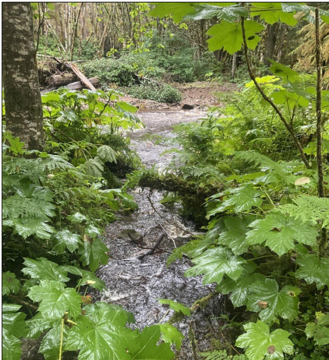
Figure 2.—Channel downstream of waypoint 1533.